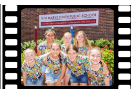
Snr Dance group