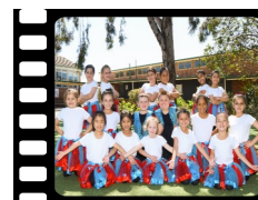
Jnr Dance group